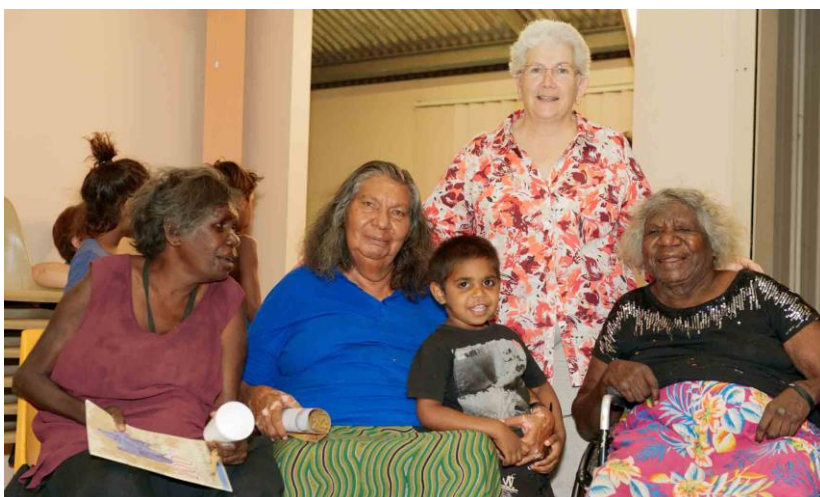
Walking Together in the Kimberley, a Book about the Josephite Sisters' presence in the Kimberley.