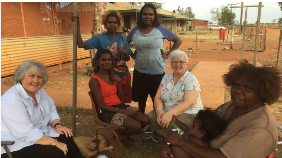
With Christabel Chamarette at Mulan.