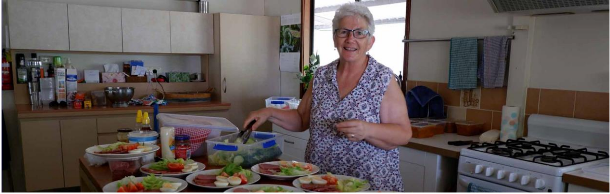
Preparing Dinner for a Retreat at Mirringki.