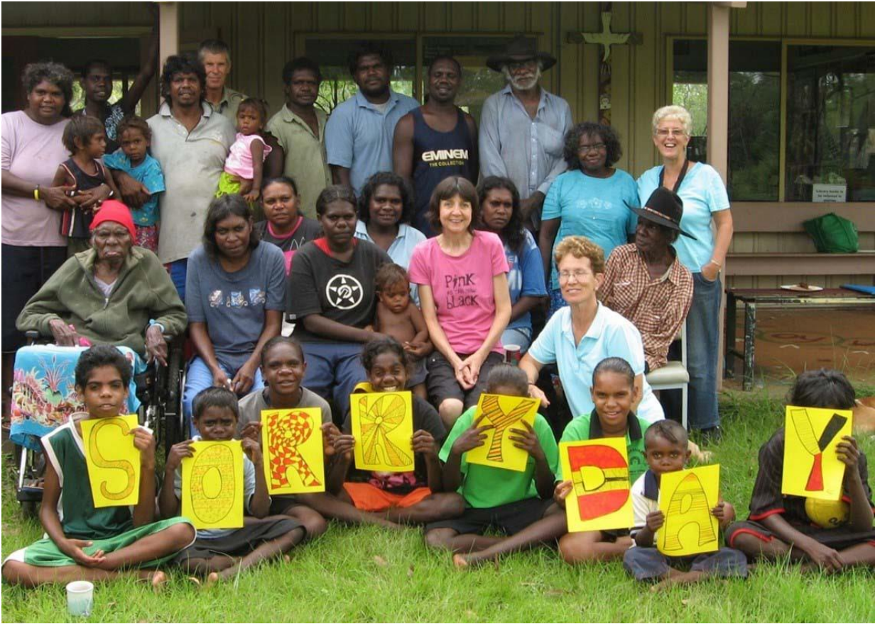
Sorry Day Community gathering at Wanalirri School, Gibb River