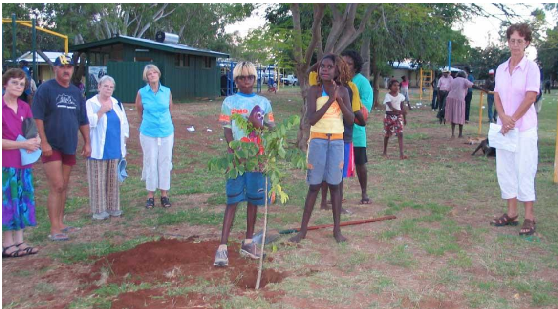
Tree planting ceremony Ngalangangpum School, Warmun.